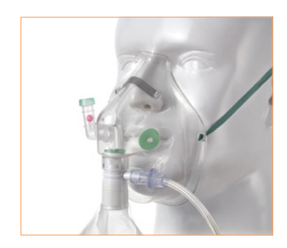
Oxygen and Aerosol Therapy • Variable Oxygen Concentration (Low Flow)