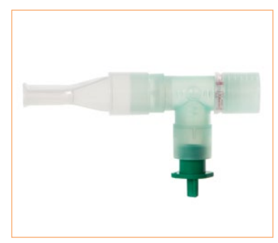
Oxygen and Aerosol Therapy • Respiratory Physiotherapy